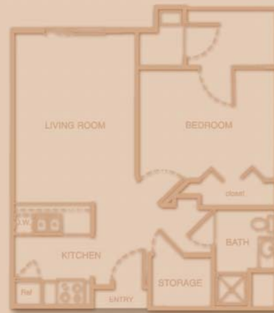
One Bedroom Floor Plan 638 square feet

Unit sizes and dimensions are approximate and may vary at time of construction