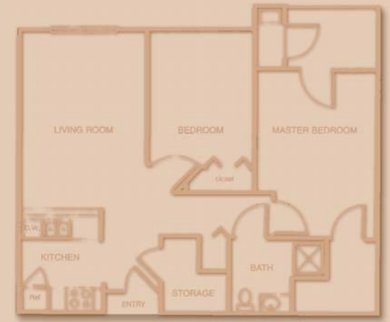
Two Bedroom Floor Plan 857 square feet

Unit sizes and dimensions are approximate and may vary at time of construction